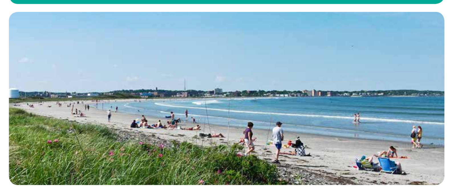
Nahant Beach, MA