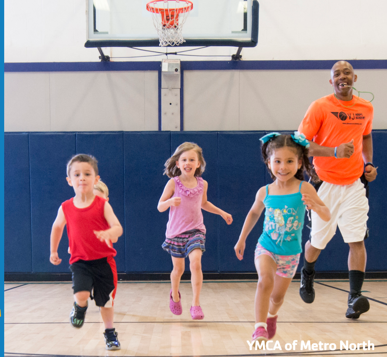
LOCATIONS IN LYNN, MELROSE PEABODY, SAUGUS, AND STONEHAM

With seven locations across the Metro North region, our association reaches a diverse range of people with passion and purpose.